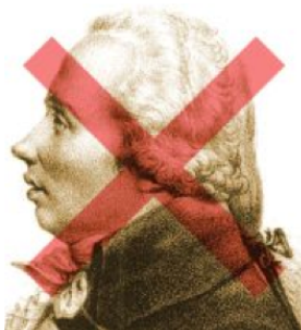
Louis Legendre (1752-1797) politician unrelated to the mathematician