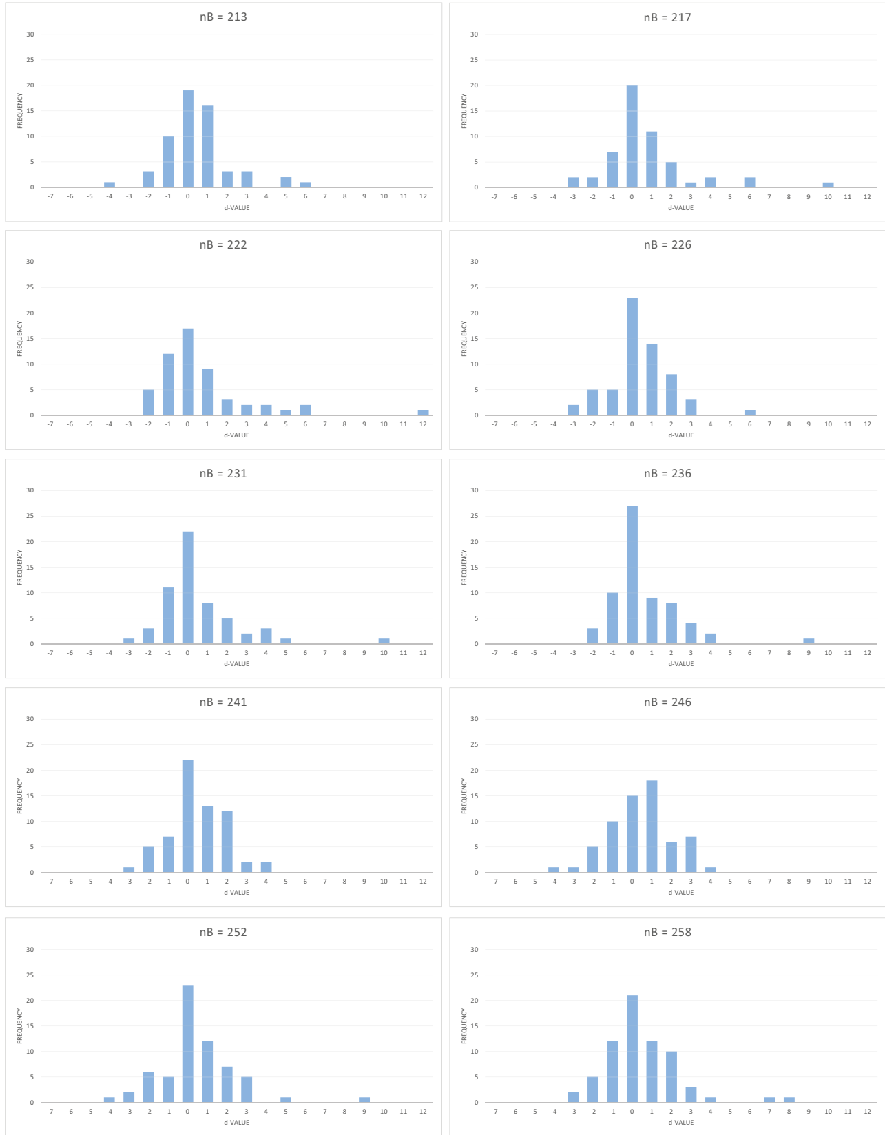
Figure 1. Distribution of d_k for our suite of experiments.